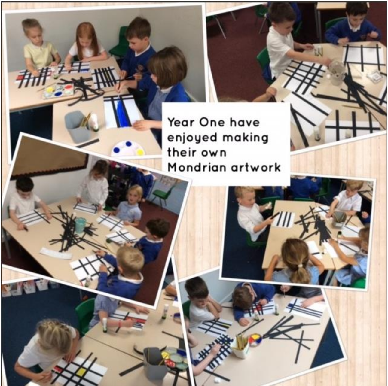
Year One have enjoyed making their own Mondrian artwork