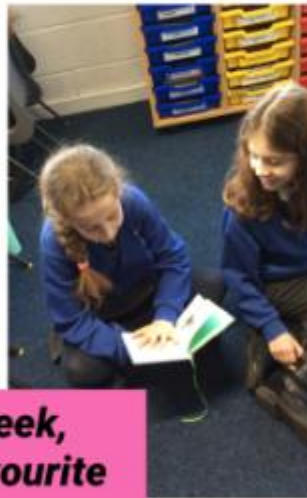
As part of National Story Telling Week, Year 4 have enjoyed sharing their favourite childhood stories.