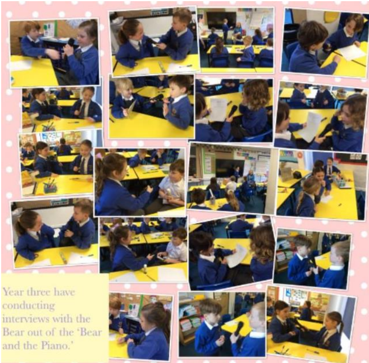
Year three have conducting interviews with the Bear out of the 'Bear and the Piano.'